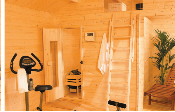
Main room showing door into sauna and loft access.